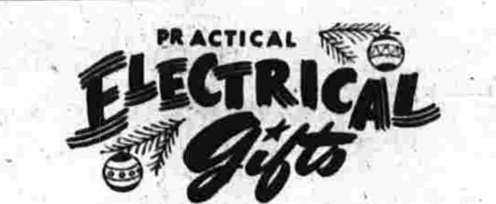
TABLE RADIOS COMBINATION RADIOS VACUUM CLEANERS ELECTRIC VIBRATORS ELECTRIC SHAVERS THE HEATING PADS ULTRA VIOLET RAY AND HEATING LAMPS ELECTRIC CLOCKS AUTOMATIC ELECTRIC IRONS

Complete Assortment of Dolls - Games - Cuddie Animals Sleds - Velocipedes - Scooters